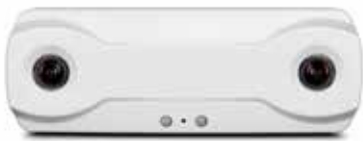
FLIR Brickstream 3D Gen 2 with BLE and WIFI