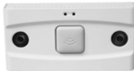
FLIR Brickstream 3D+